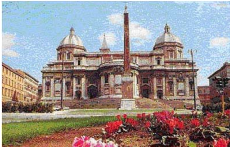
Concert at St. Mary Major Thursday, March 30, 2006 at 21:00