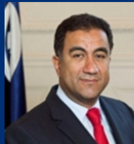
Amb. Fathallah Sijilmassi