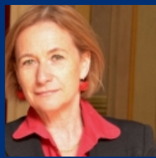
Amb. Borione Social & Civil Affairs