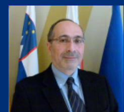
Mr. Borrego Energy