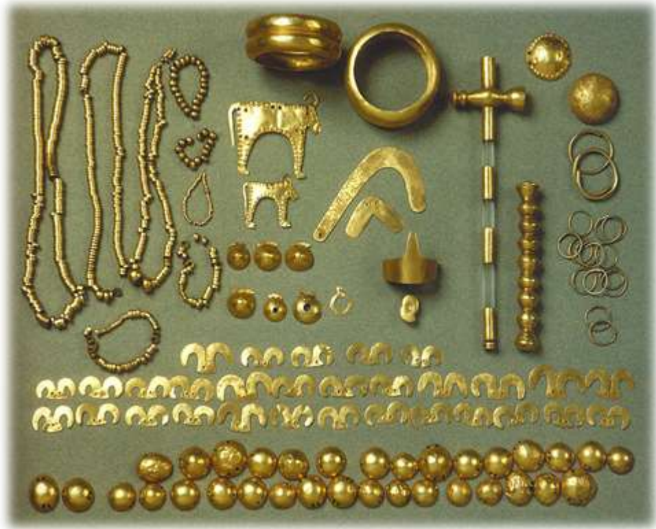
The most ancient golden treasure, dating back 5000 years BC, has been found in Varna Necropolis and it is considered the first technologically processed gold in Europe.