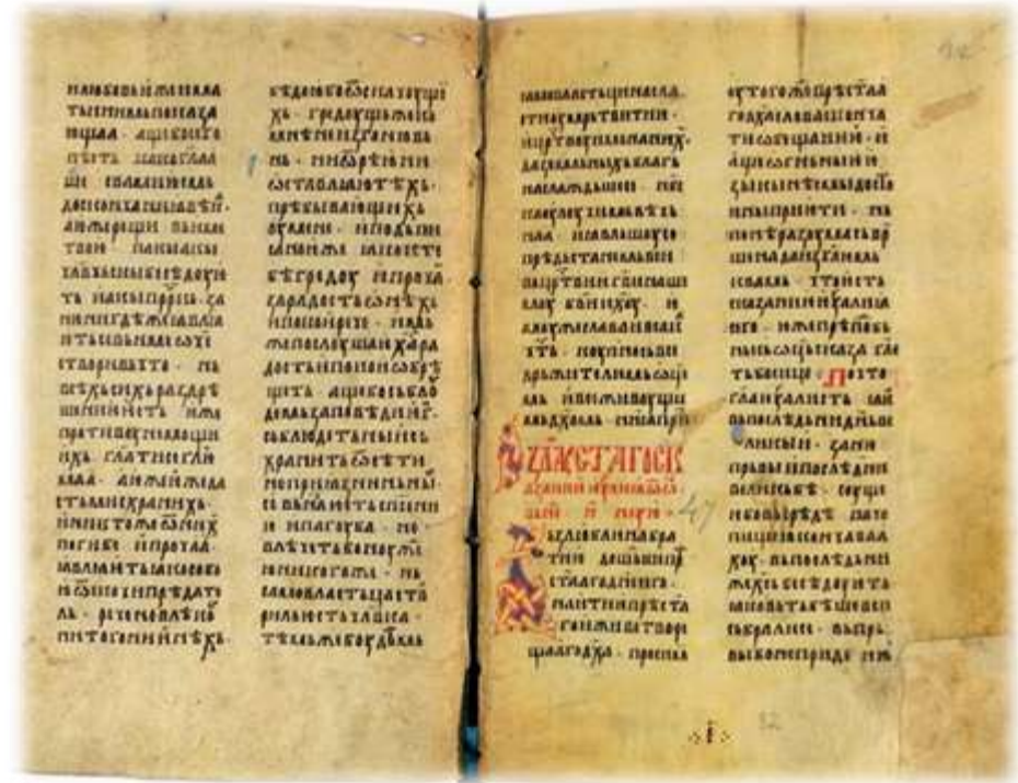
Bulgarians are the first who started using Cyrillic alphabet right after it was created in IX Century